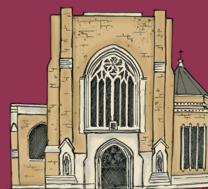
St George's Cathedral

For delegates from the Dioceses of England and Wales